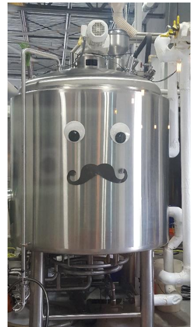
Just a few of the MANY pics from the trip. See the "SAAZ Members" page on Facebook for a bunch more!